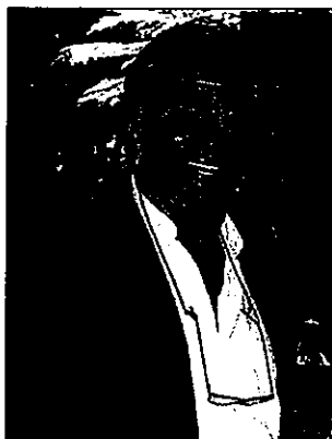
FILE - In this Aug. 9, 2007 file photo, actor Peter Falk arrives for the Hollywood Foreign Press Association's annual installation luncheon at The Beverly Hills Hotel in Beverly Hills, Calif.